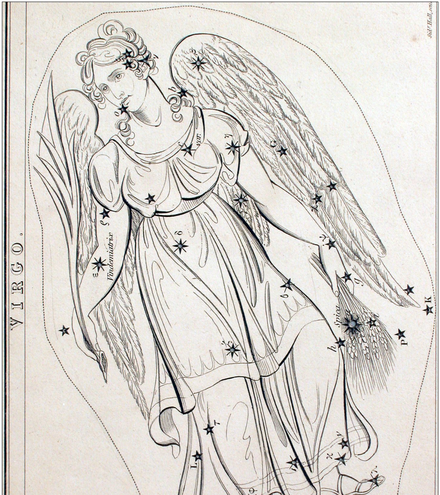
Urania's Mirror (London 1825), a boxed set of 32 cards

Exhibit: Galileo's World | Gallery: The Sky at Night | No.: 20